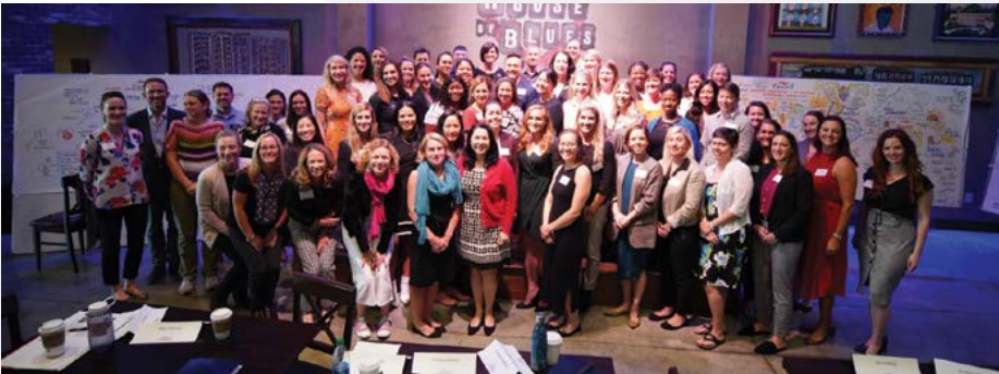
Women's Transition Mentoring Workshop, Anaheim, California

In October, COMMIT partnered with Service to School and PROMOTE to host 34 female service members and veterans for a Leadership and Transition Mentoring Workshop in Anaheim, California. The program curriculum focused on the unique employment and transition challenges women face during their career and lifestyle transitions when leaving the military.